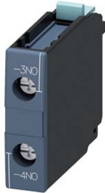
front-side auxiliary switch, 1 NO contact, screw terminal, for contactors 3RT1