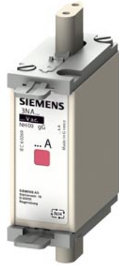
LV HRC fuse element, NH000, In: 63 A, gG, Un AC: 400 V, Combined indicator, insulated Grip lugs