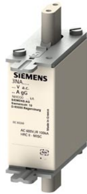
LV HRC fuse element, NH000, In: 20 A, gG, Un AC: 690 V, Un DC: 250 V, Front indicator, live grip lugs