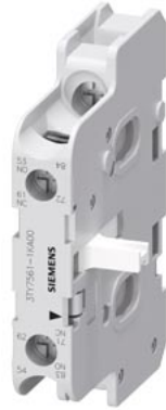
Auxiliary switch block, for size 3...12 2nd auxiliary switch block left or right